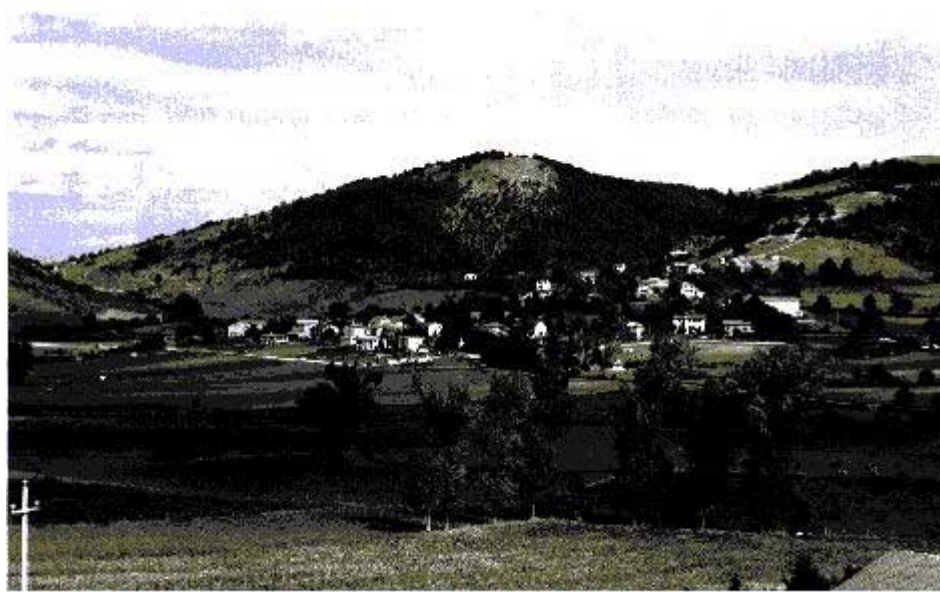
Figure 4: View of Cesi from the west.

The most representative example of intense differentiation was in Cesi village, which lies about seven kilometers south of Colfiorito (Figure 1), located on the earthquake epicenter. The village comprises about 300 residences and some public buildings founded at the foot of a small hill (Figure 4). The western part of the village occupies an almost flat expanse which corresponds to the outcrops of post-alpine formations and specifically to 10-20 meters thick terrestrial deposits consisting of coarser and finer, loose and semi-cohesive, red-brown colored clastic material. These overlies unconformably the alpine basement (Figure 5).