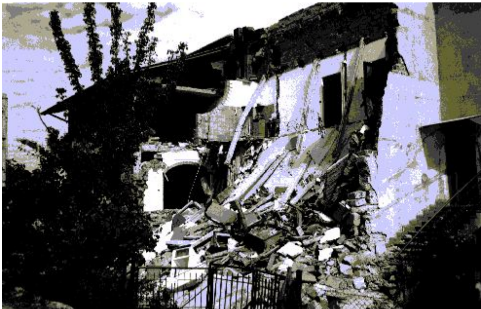
Figure 3: Construction partially collapse in the epicentral area.

The Umbria earthquake of 26th September 1997 induced extensive damage within an extended area in central Italy. Based on official reports, out of 32.865 private houses checked, 9.182 collapsed, were severely damaged or rendered inhabitable. According to official records, in about 20 villages and/or settlements, 25% of public buildings and 20% of schools were rendered demolishable, while 55% of churches received an important amount of damage (Figure 3).