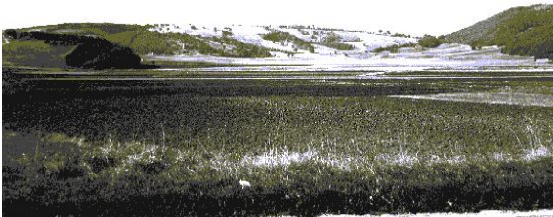
Figure 2: Pleistocene-Holocene deposits forming an almost plain relief and overlying unconformably the basement

Unconformably over the above-mentioned occurs a series of Late Pleistocene- Holocene clastic deposits. They outcrop in the low altitudes areas and intermontane valleys [Barberi et al., 1993, Boccaletti, et al., 1985, Calamita et al., 1986] (Figure 2).