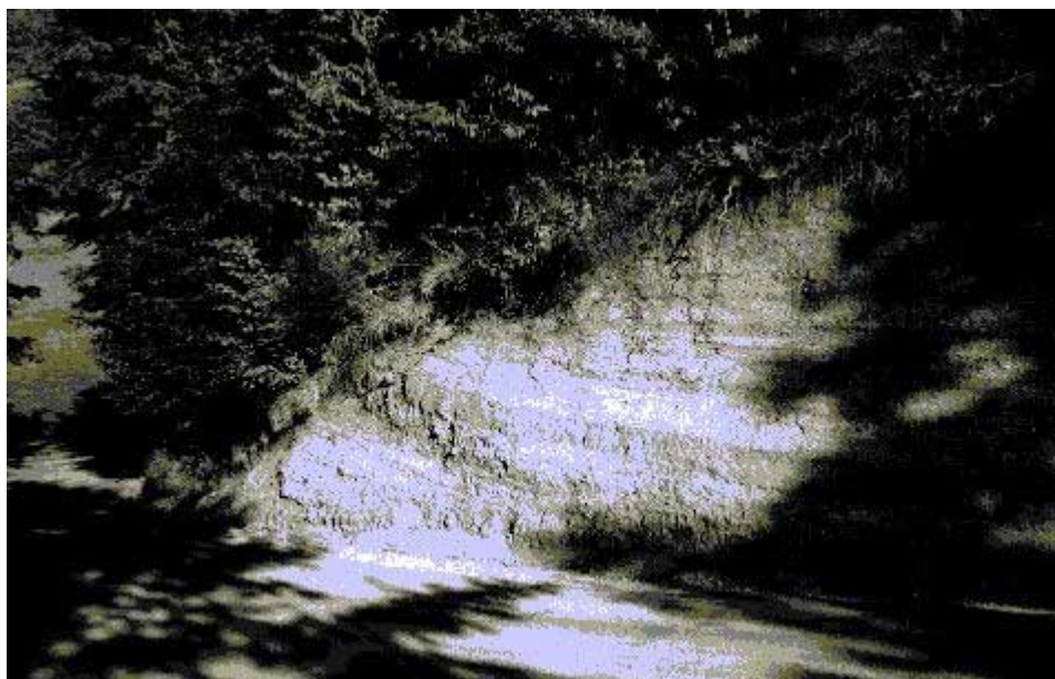
Figure 5: Recent terrestrial deposits, south of Cesi village.