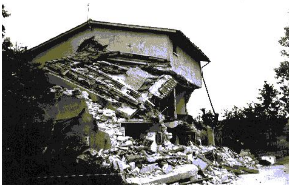
Figure 6: Damage and collapse in the west, low-lying flat part of Cesi.

The damage gradually decreased towards the eastern side of the village, built on the hilly part, where only partial collapses were noted.. The intensity for this part was I_{EMS92}=VII .