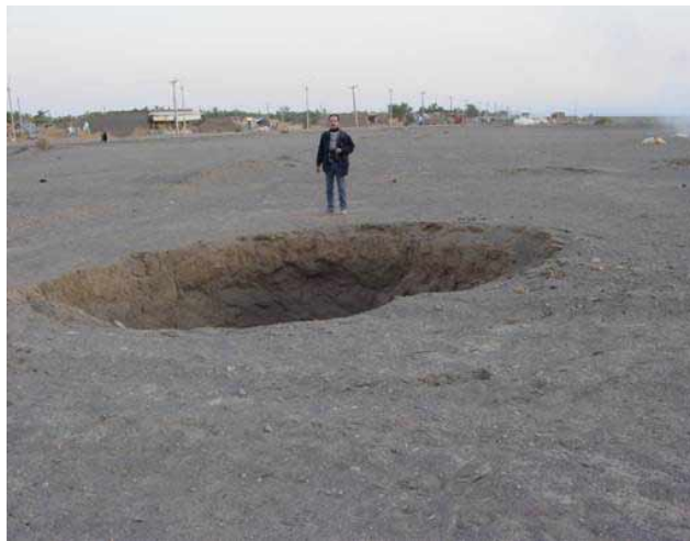
Fig. 4: Sinkhole due to collapse of a Qanat tunnel at west of Baravat [2]

Bam Earthquake has considerable effects on a lot of Qanats that excavated at the Bam area and its vicinity. Based on the preliminary evaluations, about 40 percents of these Qanats have been collapsed or experienced severe damages due to the earthquake. In some cases the collapse of the Qanats stopped the water flow completely.