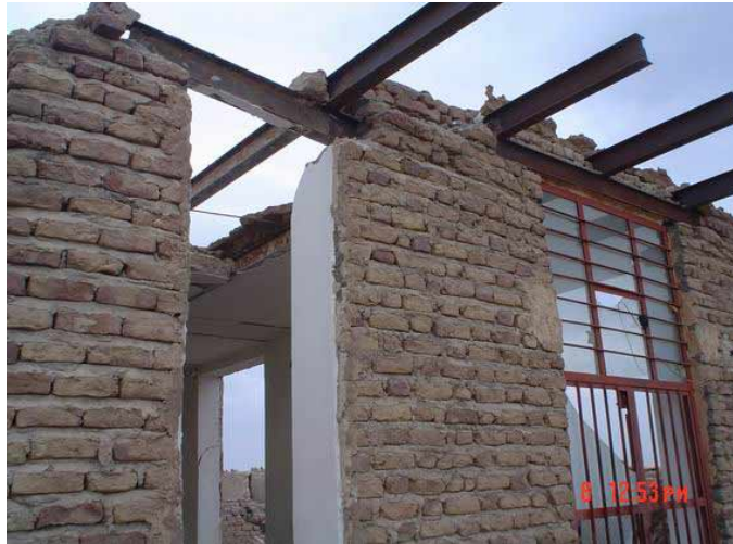
Fig. 8: In most cases the steel beams of the roof were not braced together well by steel re-bars or joists

A number of reinforced masonry buildings, with vertical and horizontal reinforced beams, were recently built in the city. The performance of these structures was good and in many cases saved the lives of their inhabitants (Fig. 9).