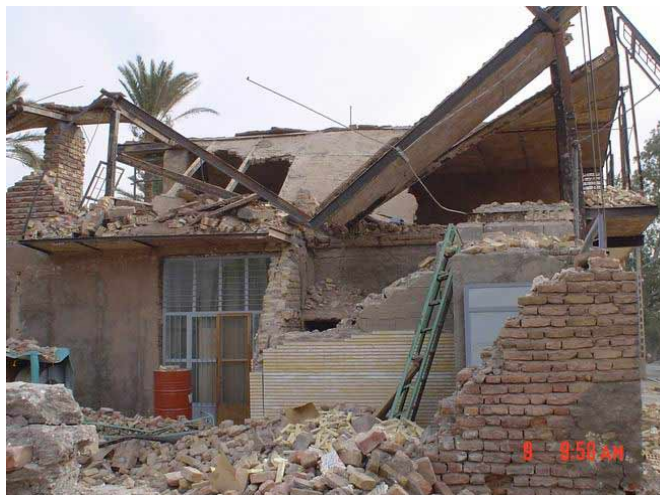
Fig. 10: first group of steel buildings, combination of steel internal columns and load-bearing external brick-walls.

to displace much more than the rigid external walls resulting in inclining of the steel columns and mostly the collapse of the whole structure (Fig. 10). This earthquake clearly demonstrated that the combination of relatively rigid load-bearing external brick walls and flexible internal steel columns is very hazardous. This type of structure is not limited to Bam, and it can be easily observed in most of the cities in the country.