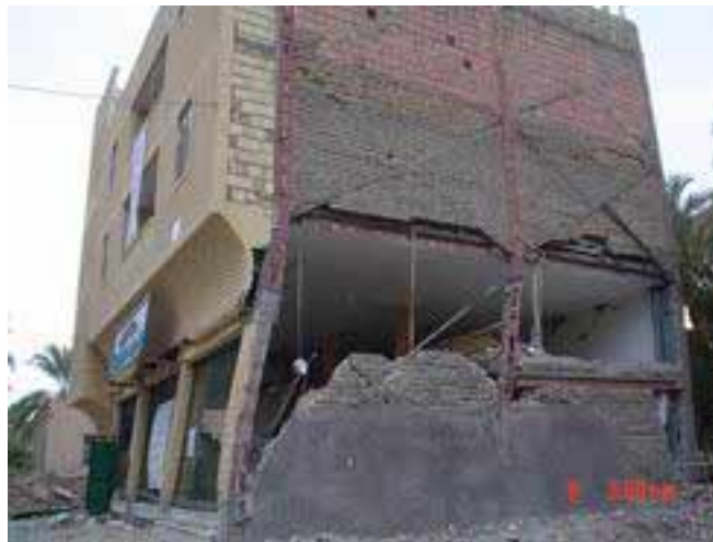
Fig. 13: Unacceptable bracing system, the cross-section of bracing member is insufficient.

The tragic event of 26/12/2003 in Bam with a M_s of 6.7, was the most destructive earthquake in recent century in the country with a loss toll of about 45000 people, after the Manjil earthquake of 20 June 1990 with a M_s of 7.2 that took lives of about 40000 people. Most casualties in this earthquake were due to the collapse of the adobe houses. The common modes of failure of masonry buildings were shear failure of walls, separation of walls from the roof, and separation of roof beams from each other. In steel buildings there were two great problems. One refers to combination of steel internal columns and load-bearing external brick-walls that this earthquake showed that it is very dangerous, and the other major problem of steel building is lack of observing proper provisions for seismic design and construction.