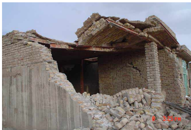
Fig. 7: shear failure of walls, separation of walls from the roof, and separation of roof beams from each other are observed in typical brick buildings.

Masonry buildings are the second most common type of buildings in the earthquake-affected area. They normally consist of kiln brick walls with shallow Jack arch roofs supported by steel I shaped beams. The steel beams are laid at a distance of 90 to 100 cm apart, and shallow brick arches fill among them. The mortar used in these buildings is sand-lime-cement, or sometimes sand-cement. The performance of unreinforced masonry buildings was not any better than abode buildings. The common modes of failure of these buildings were shear failure of walls, separation of walls from the roof, and separation of roof beams from each other (Fig. 7). In most cases the steel beams of the roof were not braced together by steel re-bars or joists (Fig. 8). As a result, dropping of the bricks between them during the earthquake, could be expected.