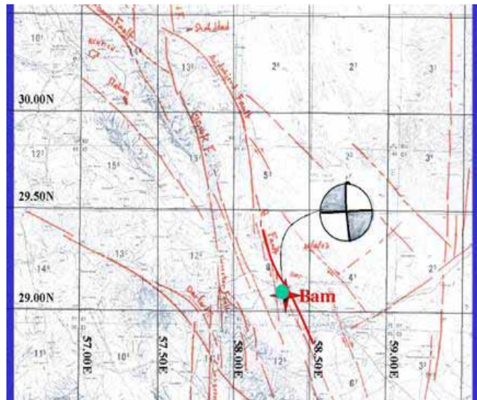
Fig. 3: The fault map of the Bam earthquake prone area of the 26/12/2003 earthquake[1]

or greater than 6 has struck Iran every year during this century. Around 200,000 people have died in earthquakes in Iran during the last 100 years [3].