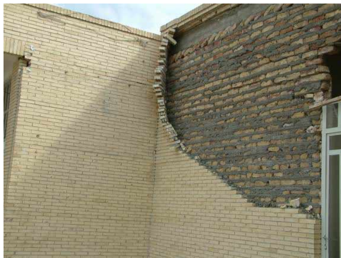
Fig. 9: an example of reinforced brick buildings in the earthquake-affected area with a relatively good performance.

A number of reinforced masonry buildings, with vertical and horizontal reinforced beams, were recently built in the city. The performance of these structures was good and in many cases saved the lives of their inhabitants (Fig. 9).