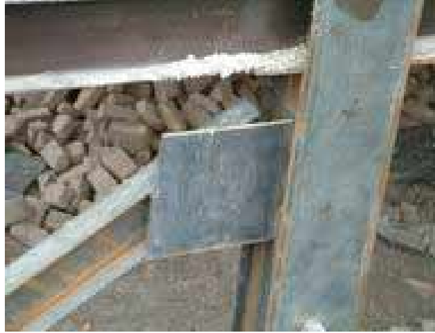
Fig. 12: incorrectly bracing system and its gusset plate