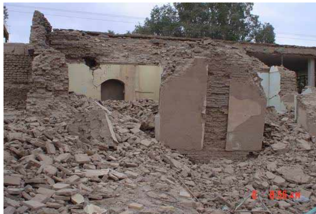
Fig. 5: Heavy walls, thickness of wall in some abode houses reaches to about 1 m

Most houses in the epicentral area are abode construction, usually one-story made of sun-dried brick walls, and domed roofs or vaults with clay or mud mortar. This type of construction is common in the dry areas of Iran because abode houses need only local materials and can be built by farmers when their work is tax. The walls and roofs of these houses are thick (usually 40 to 80 cm) and heavy so that they easily protect their inhabitants from the cold and hot weather, but they are very weak in resisting horizontal vibrations particularly at the junctions of vertical walls and domed roof (Fig. 5).