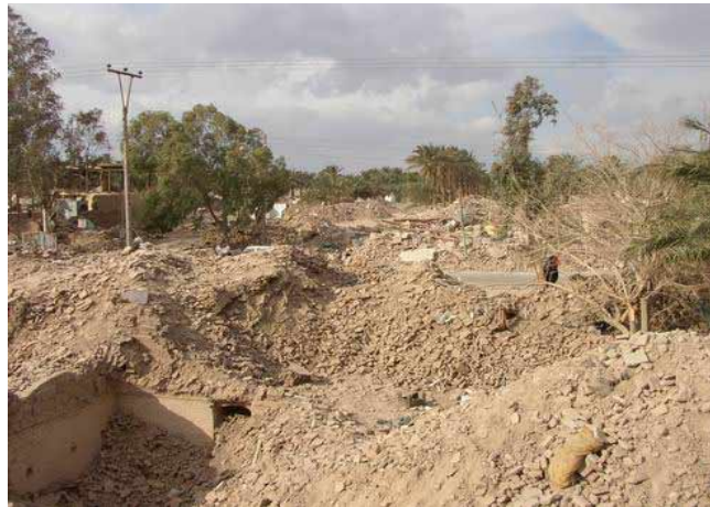
Fig. 6: ground shaking was so severe that the abode houses were turned into their original sun-dried bricks in the Bam 26.12.2003 earthquake.

some region the ground shaking was so severe that the abode houses were turned into their original sun-dried bricks (Fig. 6).