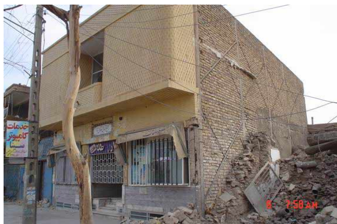
Fig. 11: steel building with good performance during the Bam 26.12.2003 earthquake

The second group of steel buildings consists of steel frames only in one direction with bracing in one or two directions. They are actually designed for some horizontal forces. The performance of this type of construction was generally satisfactory (Fig. 11). Exceptions are made when the bracing were placed eccentrically or incorrectly (Figs. 12 and 13). In these cases, the infill or curtain walls usually experienced severe damage.