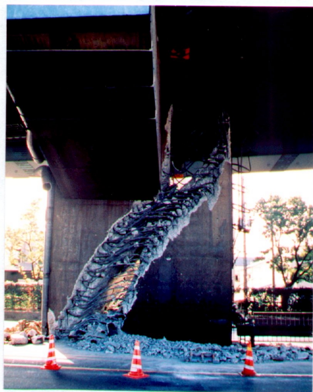
Figure 3: Hanshin-Express Highway (Designed 1966) Kobe-Earthquake 17. Jan. 1995 [Yamada, 1996, 1998]