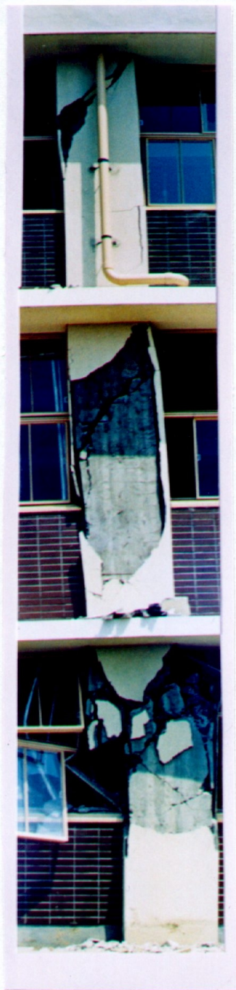
Figure 2: Misawa Commercial High School, Tokachi-Oki. EQ., Japan 16.May. 1968 [Yamada, 1968, 1972, 1974]