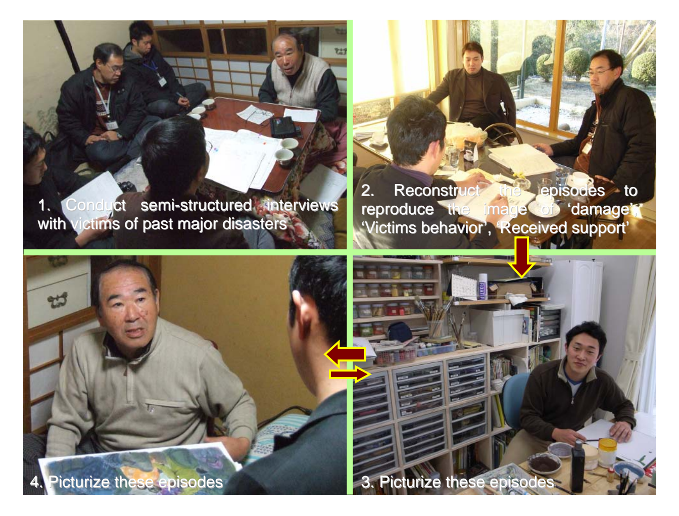
Figure 2 The schematic process of making pictures which describe a personal disaster experiences.