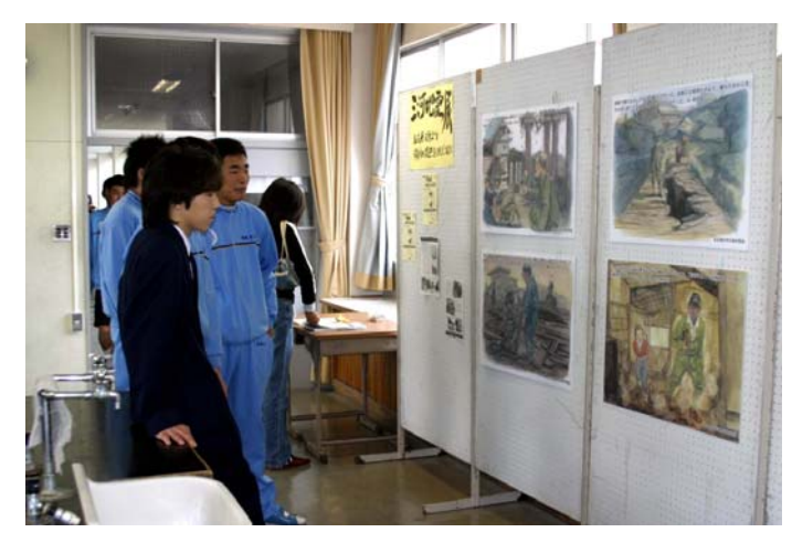
(3) An exhibition using the pictorial materials held in a junior high school

Figure 4 Example of various disaster management lectures and exhibitions which using pictorial description of personal disaster experiences.