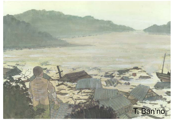
He was able to scramble up a nearby mountain, and escape. Looking down upon his town from his mountain vantage point, it was smothered in seawater.

As he was heading towards the shore, he realized that multiple houses had been entirely uprooted by the waters, and were sweeping directly towards him.