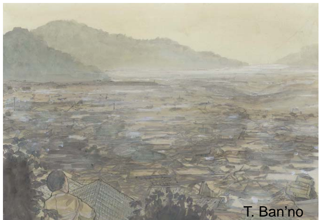
The water drew back so far that the bay was drained of water, and he saw – for the first and only time – the local bay looking like a large, empty mortar.

Figure 3 An example of pictorial description which described a personal disaster experience.