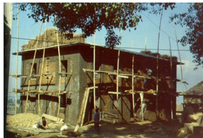
(b) During construction