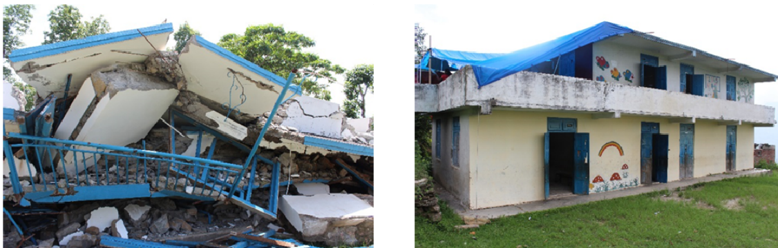
Fig.8 – Two neighboring schools in Sindhupalchowk both built through international donor support but taking different approach of community outreach for technology transfer.