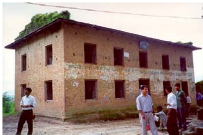
(a) Before construction

Figure 2 shows the actual construction process in Bhuvaneshowri School Bhaktapur, the first retrofitted school in Nepal. The timber floors were replaced by thin concrete slab to make the rigid diaphragm. The roof battens were braced and tied to wall at the roof band. Gable walls were also reinforced and anchored to the roof system. This system of seismic upgrading is typically applied in URM schools buildings. In some schools the micro concrete cover is applied in the entire wall in the form of jacketing.