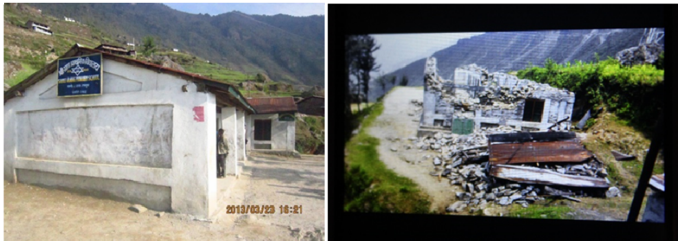
Fig.7 – Complete collapse of retrofitted school building in Rasuwa.

Where local masons were appropriately trained and where trained engineers oversaw the construction practice by very frequent visits or continuous onsite presence, school performed beautifully. They were completely undamaged and few signs of poor construction practice were evident. In figure 8, the first was built without technical support. The second was built after the community was given an orientation on earthquake safe construction and local masons were trained in safer construction techniques. An engineer and lead mason, both with experience in earthquake-safe school construction, carefully oversaw the process. After the earthquake, the second was operational; even the terrace had been covered and converted into a makeshift workshop for the local community. Clearly, the social supports of training and oversight are crucial to achieving safe school construction in Nepal.