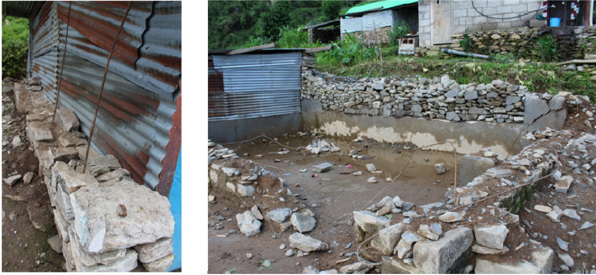
Fig. 5- A Ministry of Education template design, which called for vertical rebar to be placed in stone walls, completely collapsed in every block assessed with this design.