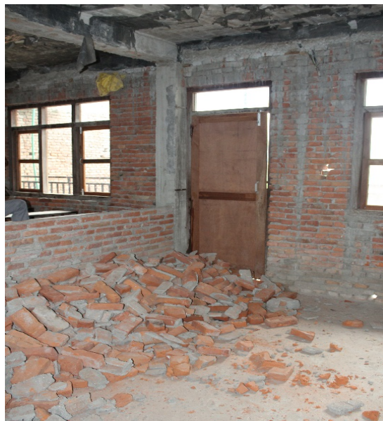
Fig. 4 - School building 101-1 experiencing only moderate shaking deemed unsafe.

Two ubiquitous school template design approved by the Ministry of Education performed particularly poorly. The first was a metal frame supporting a corrugated metal roof, a design originally developed by a major bilateral development assistance agency. While the metal frame and roof were undamaged, the communities report that they were told to build exterior walls in whatever local material was available.