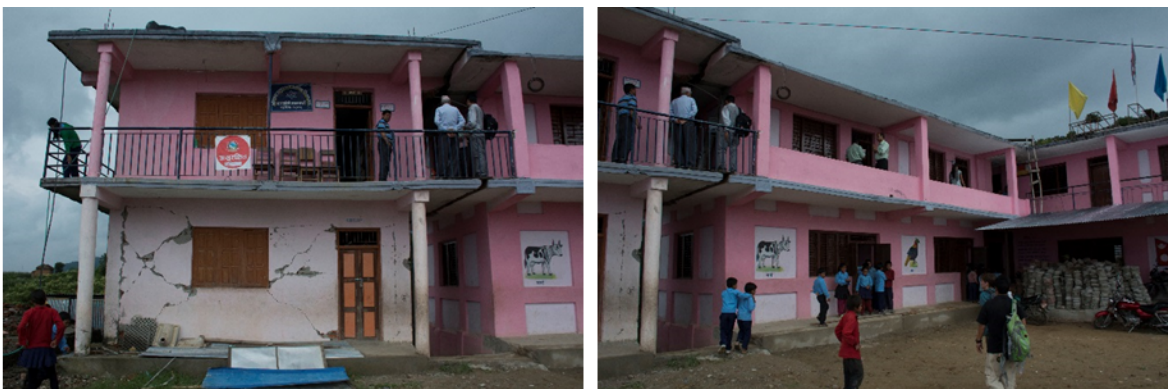
Fig.3 – Two blocks in same school received different damage in the earthquake.

In some cases, different blocks in the same school site provided comparative assessment between buildings. These blocks usually were built from different resources using different method. Figure 3 shows an example of Kathmandu school site where blocks with different construction system behave in the earthquake. Here, two blocks built at same time performed very differently as one block was of unreinforced masonry wall upgraded later for seismic enhancement and other block with reinforced concrete. The reinforced concrete block with no seismic upgrade was moderately damaged and received a red tag. It will need to be repaired before it can be reused for classrooms. The block on the right was recently retrofitted with splint and bandage. It was undamaged and immediately able to be reopened.