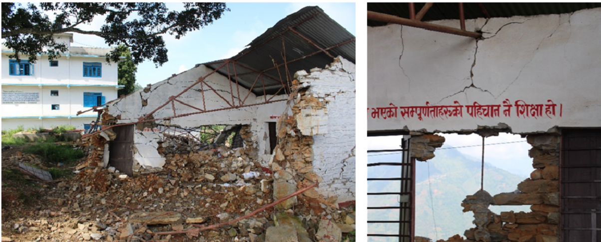
Fig. 9 - Complete collapse of stone masonry teaching resource centre building with concrete bands.

The widespread rubble stone collapses, even in a case where a lintel band and vertical reinforcement had been used, suggests that constructing safely with rubble stone is fraught with difficulties. Further research is needed to understand how other rubble stone schools with earthquake-resistant features fared and what technical and social intervention seem to have worked well. However, until further testing or comprehensive field assessment, extreme care should be taken in building infill or load-bearing walls with this material in permanent, transitional, or temporary school buildings. Further, even if safe and appropriate technologies for rubble stone are identified, school reconstruction with this material will need to be carefully supported with robust programs for training, oversight and community outreach so that safety is achieved in actuality and communities can trust that these stone buildings will not collapse.