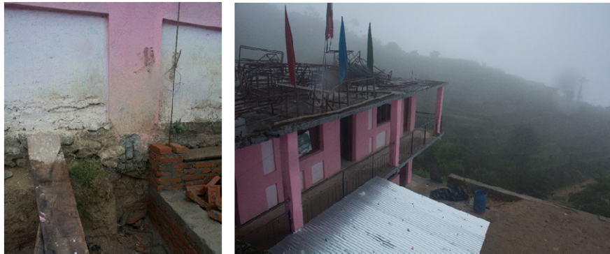
Fig.6 – Several design and construction flaws observed in a recently upgraded school building in Kathmandu.

Where local masons were appropriately trained and where trained engineers oversaw the construction practice by very frequent visits or continuous onsite presence, school performed beautifully. They were completely undamaged and few signs of poor construction practice were evident. In figure 8, the first was built without technical support. The second was built after the community was given an orientation on earthquake safe construction and local masons were trained in safer construction techniques. An engineer and lead mason, both with experience in earthquake-safe school construction, carefully oversaw the process. After the earthquake, the second was operational; even the terrace had been covered and converted into a makeshift workshop for the local community. Clearly, the social supports of training and oversight are crucial to achieving safe school construction in Nepal.