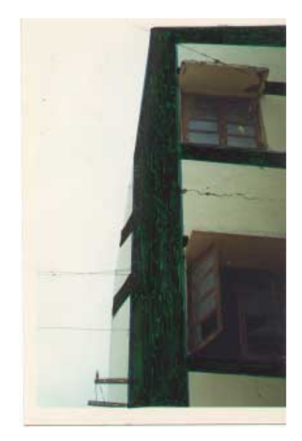
b) GREEN COLOUR SHOWS VERTICAL SPLINT AND HORIZONTAL BANDAGE