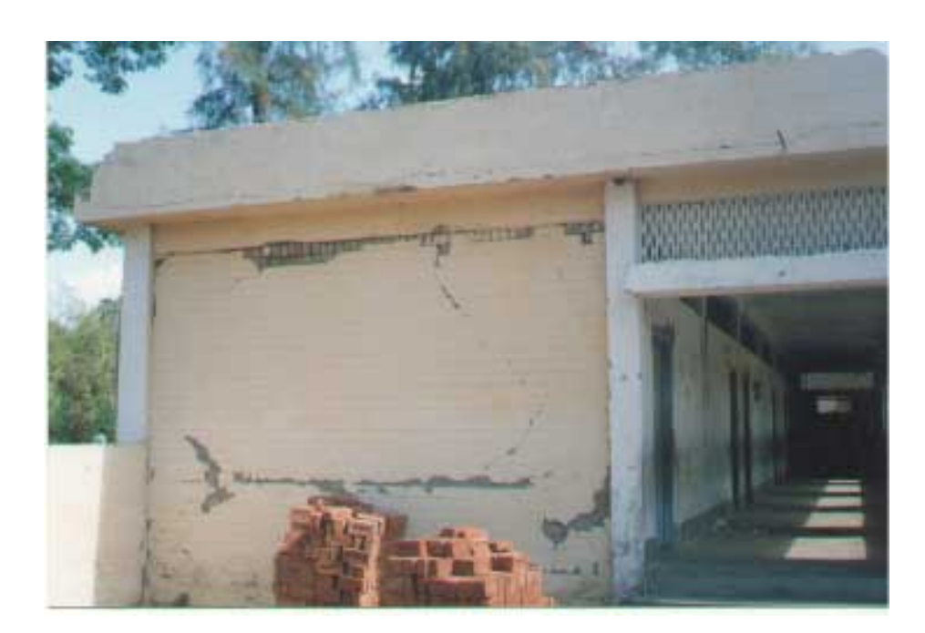
Photograph no.7:- seperation of wall panel from main frame

For retrofitting of this brick panel. Remove old plaster. Fix the strip of welded wire mesh and chicken mesh on the frame (i.e. on columns and beam) and on brick panel. These wiremeshes must be properly anchored to the frame and brick panel. This treatment must be done on both sides of wall. Plaster the surface with cement mortar (1:4).