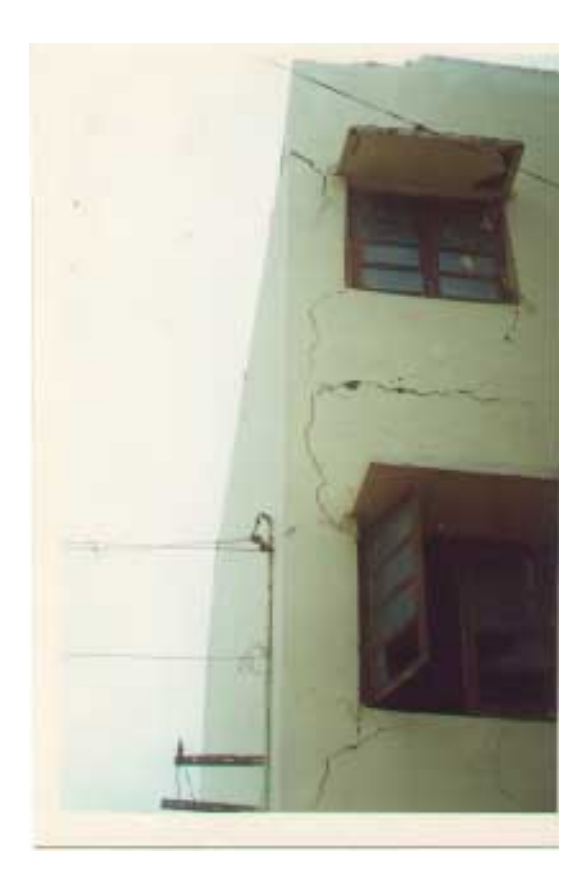
a) ACTUAL CONDITION

It was observed that the buildings without continuous lintel band suffered badly. Separation of walls was observed. Most of the damages are due to the faulty construction practices such as, providing doors and windows near corner without taking proper precaution, providing very large size of opening. Providing foundations to some selected walls only. So, some walls were 100mm thick partition walls, which were unable to provide any resistance during earthquake shaking.