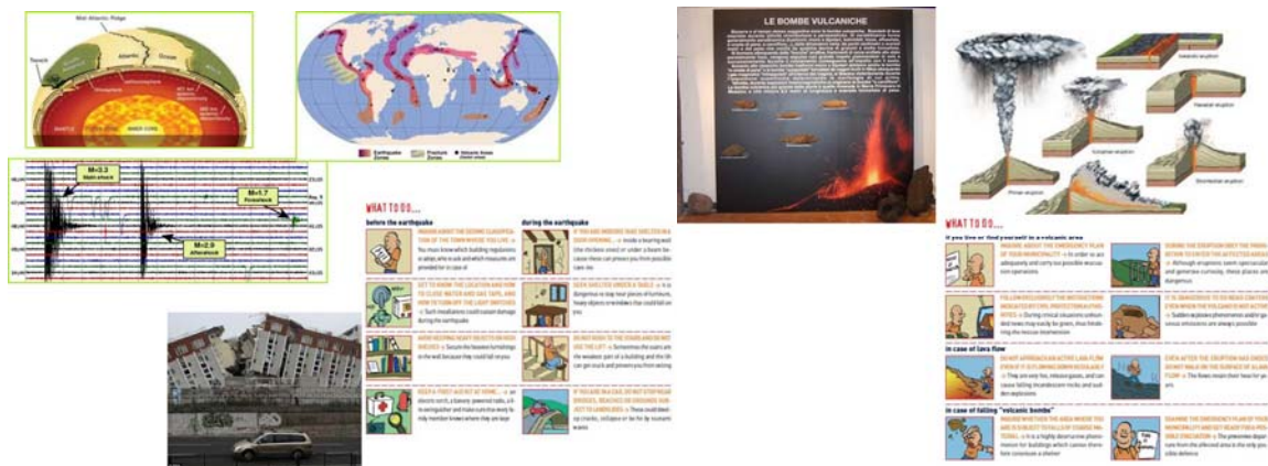
Figure 1. Examples of topics displayed

The first step is to identify topics and sub topics about seismic and volcanic phenomena, their impact on human society, and the most suitable measures to mitigate this impact also through appropriate behaviour preparedness (figure 1). Topics related to local seismic and volcanic history, local beliefs and myths, have to be included. It is indeed important to correct traditional misunderstandings, which could lead to inappropriate behaviour in case of seismic and/or volcanic events.